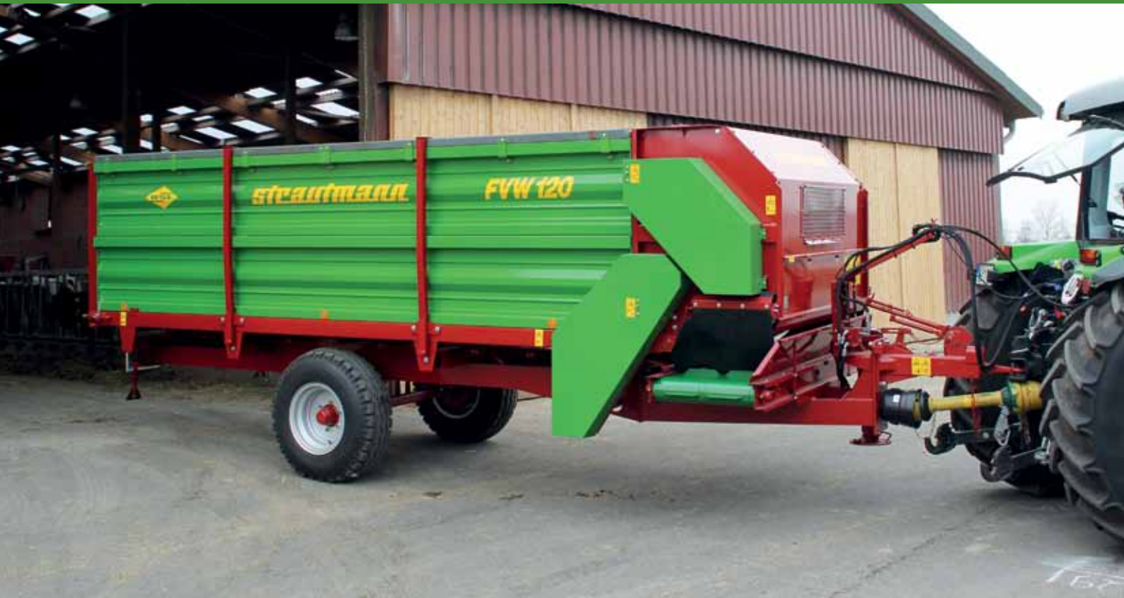
Fodder distribution wagon