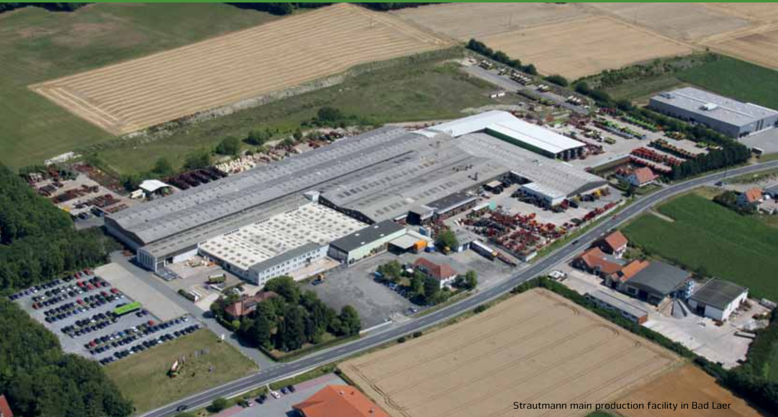
Strautmann main production facility in Bad Laer

B. Strautmann & Söhne GmbH u. Co. KG is a medium-sized family-owned company located in the administrative district of Osnabrück having already celebrated its 80th anniversary of existence and now being managed by the third generation. In a modern plant at the second production site in Lwówek (Poland), Strautmann manufactures individual machine components and, apart from that, also parts